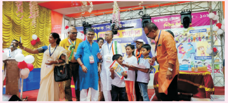
Distribution of Hand Books & Note Books for 200 child of Madhyamgram Sristir Pathe, Abdalpur