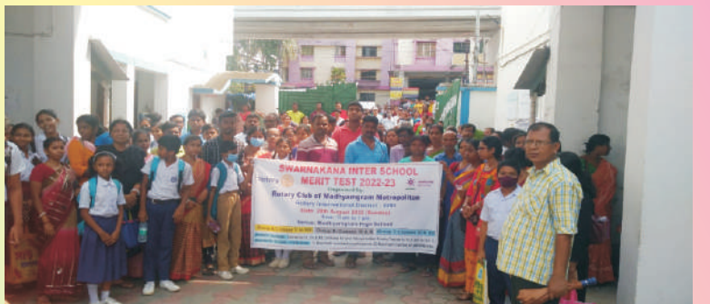
Swarnakana Inter School Merit Test at Madhyamgram High School