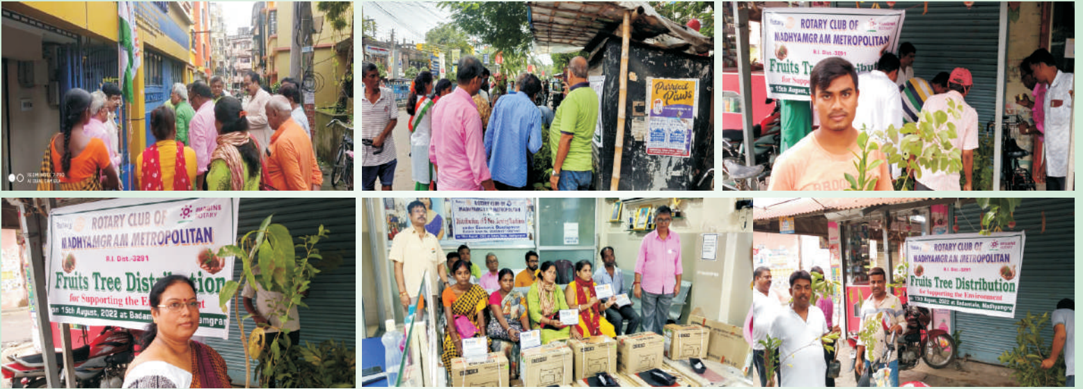
Independence day Celebration, Tree & Swing Machine Distribution (under District 3291 - 50-50 Grant)