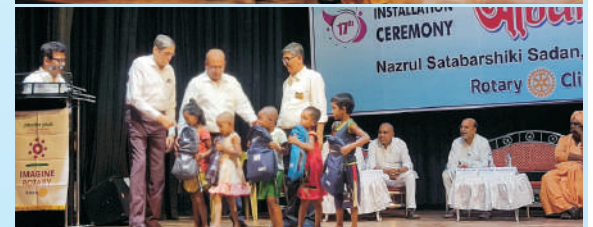
17th Club Installation with Project Swabikash & Child Literacy