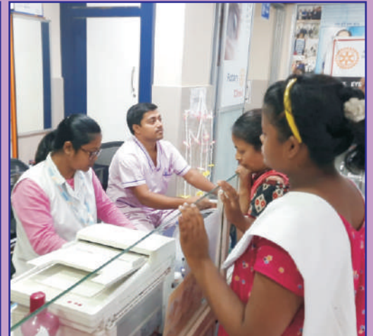
Eye Check-up Camp & other Service of Rotary Clinic