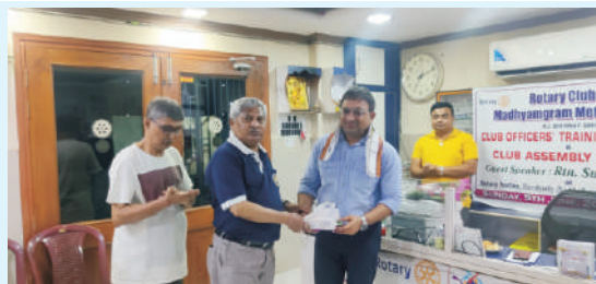
Club Officers Training Seminar